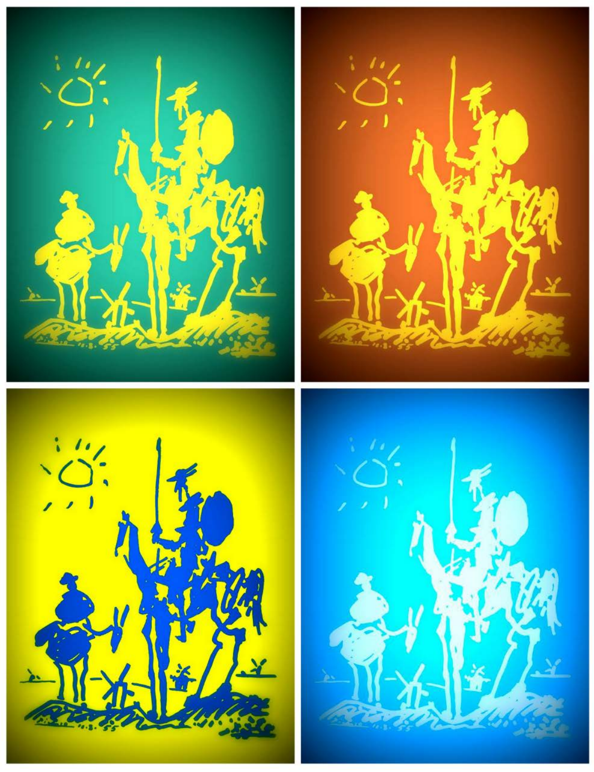
The Story & Identity of L/L Research